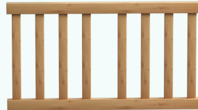
1× Bottom Panel