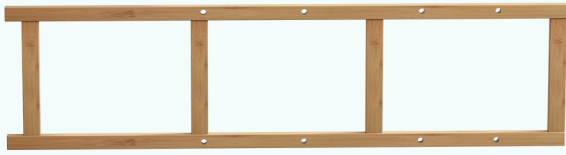
1× Long Side Frame