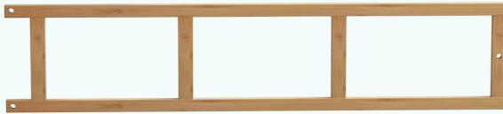
1× Long Side Frame