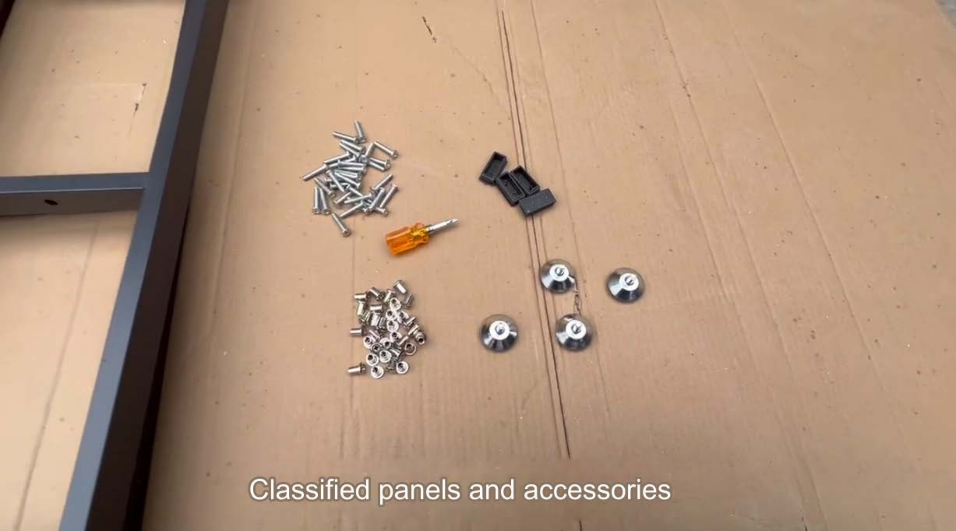
Classified panels and accessories