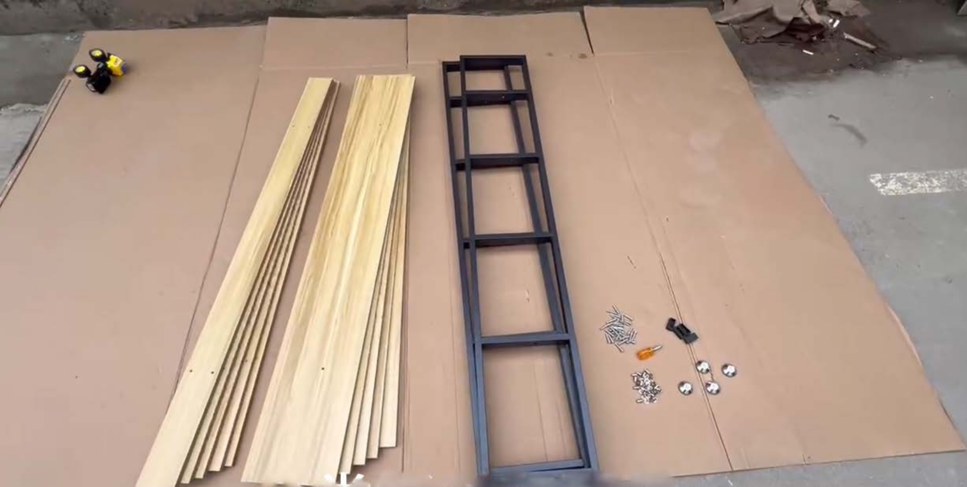
Classified panels and accessories